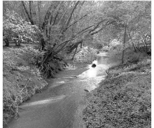
<u>This Photo</u> by Unknown Author is licensed under <u>CC</u> <u>BY-SA</u>

Please refer to the bulletin board outside the office door at the Romney Fire Dept for a list of all meeting dates.